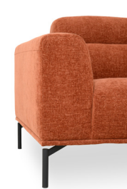
Arm A - 22 cm